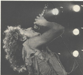
Roger Daltrey delivering the finale to Pete Townshend's rock opera Tommy , which is heavily represented on the band's new four-CD box set.

"I Can't Explain", "Anyway, Anyhow, Anywhere" and "My Generation" remain an opening salvo unmatched in rock history, unless it's by the Sex Pistols' equally manic hello to the outside world. What happened next is the subject of the box set, which charts the Who's turbulent, driven passage from chroniclers of a youth cult and a time to patently unwilling vehicles for Pete Townshend's increasingly personal psychological excavations.